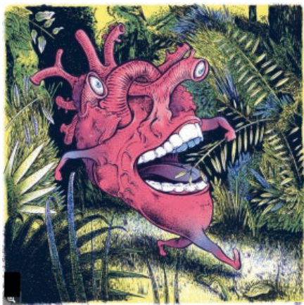
Heart Healthy in the Amazon; New York Times, April 6, 2017.

The control of cholesterol and other risk factors may also have significant bearing on other noncommunicable diseases as well. It has been suggested that the coronary risk factors are closely associated with development of Alzheimer's Disease. Recently, the brain imaging was performed for the assessment of amyloid deposition in brain (suggestive of degenerative brain disease). Mid-life abundance of risk factors including hypercholesterolemia, diabetes, hypertension, smoking and obesity determined higher likelihood of amyloid deposition 2 decades later; the correlation persisted even after normalizing for genetic basis of Alzheimer's disease. Similarly, use of statins has been demonstrated to be directly related to lower incidence of malignancies. The experimental data suggest that the cholesterol metabolite 27-hydroxy cholesterol promotes the breast tumor growth in mice. 27-hydroxy cholesterol has been demonstrated to bind to estrogen receptor and its antagonist is equally effective as inhibition of estrogen receptors. Similarly, in clinical scenario, circulating 27-hydroxy cholesterol levels are higher in patients with breast tumor recurrence.